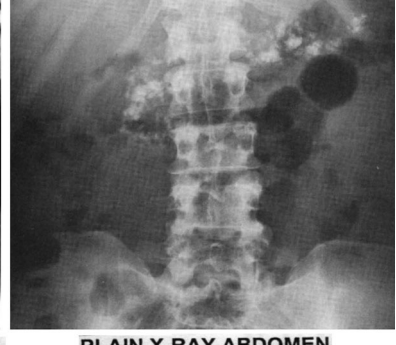
PLAIN X-RAY ABDOMEN - PANCREATIC CALCULI